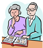
PHOTO DIRECTORIES ARE IN —If you had your photo taken last winter with us it's time to pick up your photo